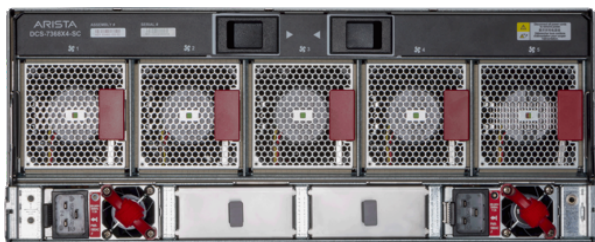
System Rear (Front to Rear Airflow)