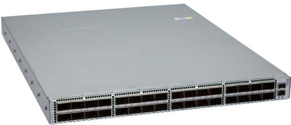
7060PX4-32 Switch with 32 x OSFP Ports