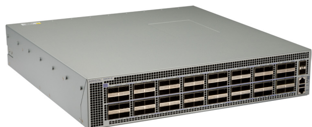
7260CX3-64 Switch with 64 x QSFP100 Ports