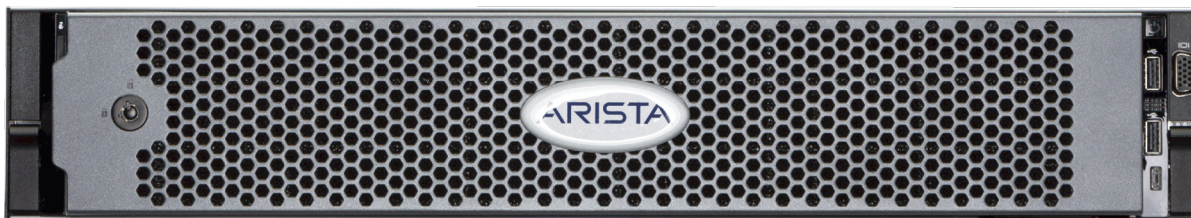
Arista DMF Service Node: DCA-DM-SDL