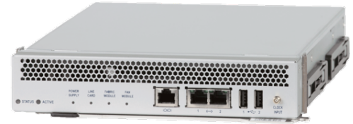
Arista 7300X Series Supervisor Module