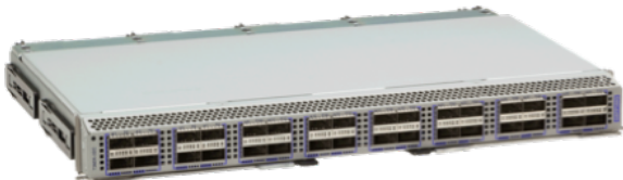
Arista 7320X Series 32 port 100GbE Line Card

The Arista 7320X Series can be populated with up to eight high density 100GbE line cards. For environments requiring the highest performance combined with interface flexibility the 7320X line cards support five speed choices on each port. Each port can be configured for quad 10GbE or 25GbE, dual 50GbE or single 40GbE and 100GbE. Speed changes and breakout modes are enabled independently of the other ports on the line card. Additionally a wide range of both copper and fiber optics for all speeds are available with full support for industry standard connections. Each 7320X line card supports wire speed layer 2 and 3 forwarding and support for a wide range of L2 and L3 features.