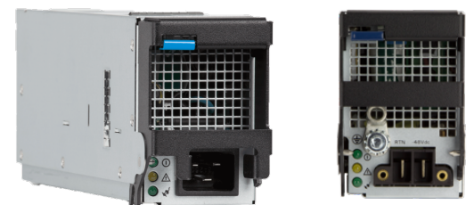
Arista 7320X Series AC and DC Power Supplies

The AC power supplies are Titanium climate saver rated and have an efficiency of over 94% across typical loading with a single stage conversion to the internal DC voltage. The DC power supplies require inputs at -48V DC to deliver up to 2700W. The 7320X Series uses multiple small power supplies which allows for incremental provisioning and smaller input circuits. Variable power supply fan speeds ensure power supply efficiency is optimized and reduces noise in data center environments.