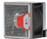
Arista 7320X Series Fabric and Fan Modules