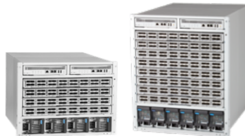
Arista 7320X Series 100GbE Modular Data Center Switches

With front-to-rear airflow, redundant and hot swappable supervisor, power, fabric and cooling modules the system is purpose built for data centers. The 7320X Series is energy efficient with typical power consumption of under 17 Watts per 100GbE port for a fully loaded system. These attributes make the Arista 7320X Series an ideal platform for building reliable, low latency, resilient and scalable data center networks. Combined with Arista EOS the 7320X Series delivers advanced features for cloud, big data, virtualized and traditional designs.