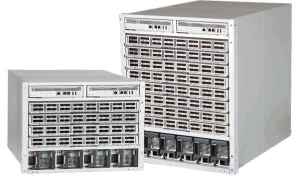
Arista 7300X Series Chassis

The midplane is completely passive with orthogonal connectors that provide direct connectivity between each of the fabric and line card modules. The system is optimized for data center deployments with front-to-rear airflow and can be installed in both standard 4-post and 2-post rack or cabinets without special modifications.